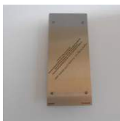
Blind cover 2000BC/2100BC