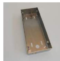
In wall box for flush mounting 2000UP/2100UP

A company's entrance is what customers see first. An exclusive and customized door intercom acts like a business card and leaves a first positive impression. The HVI-TEC door intercoms are made of pure stainless steel and impress with their quality, elegant design, durability and protection against vandalism. The front panels are finished with a fine vertical cut, the frame and call buttons are polished. The exclusive door stations are available with analog and IP technology. On request, with optional customer-specific engravings, lettering, decorations and digital printing, each door station can be made to be delivered with a personal touch, we will be happy to advise you.