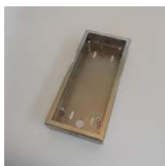
On wall box, for surface mounting 2000AP/2100AP