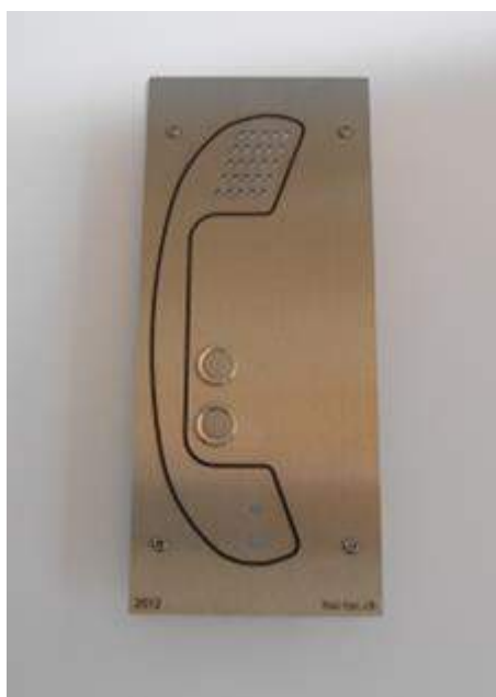
Number of call buttons may differ from the picture